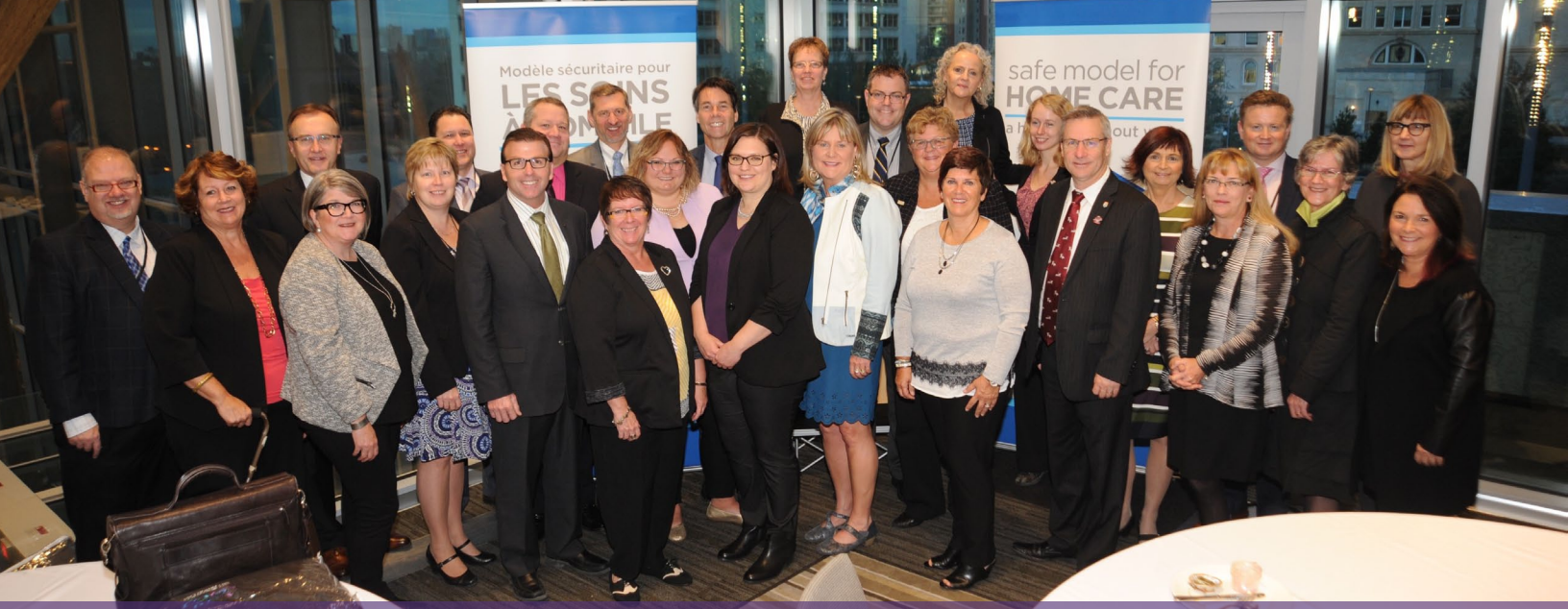
Nurse union leaders with provincial and territorial health ministers during the breakfast on October 19