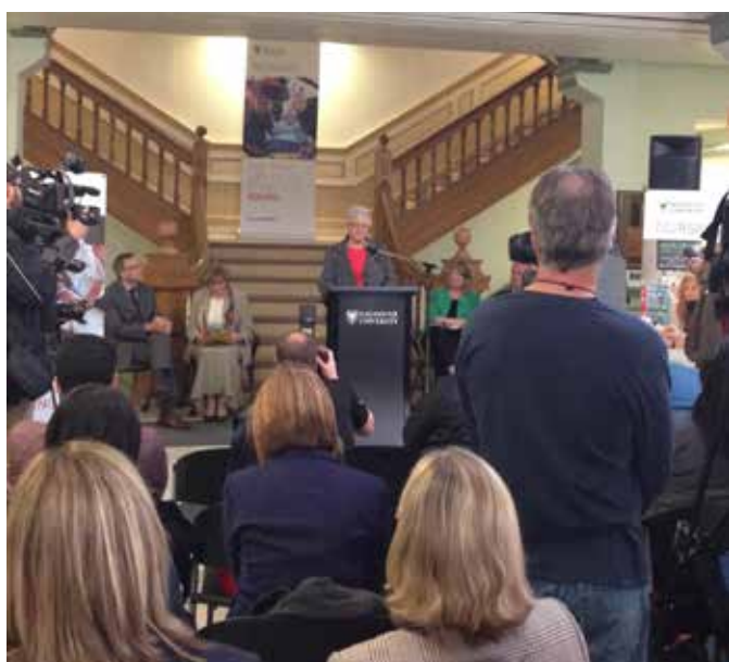
Government announces new Provincial Nursing Strategy at the Dalhousie School of Nursing on May 12